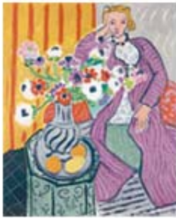
the fabric of dreams his art and his textiles